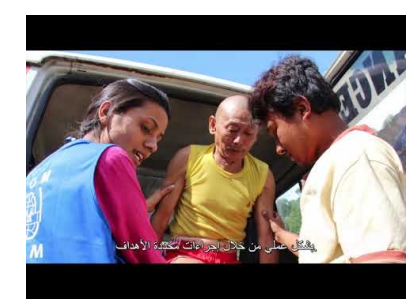
تعميم الحماية _ الترجمة العربية