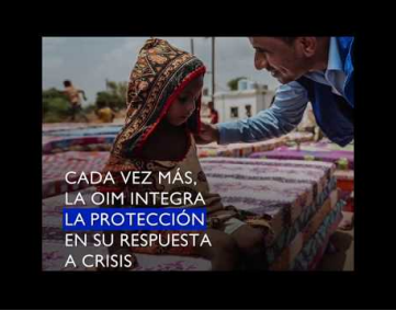
La labor de protección de la OIM en su respuesta a crisis