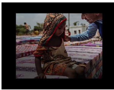
Le travail de protection de l'OIM dans la réponse aux situations de crise