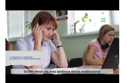
Incorporación de la perspectiva de protección