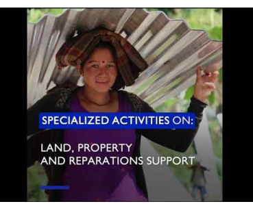
IOM's work on protection in crisis response