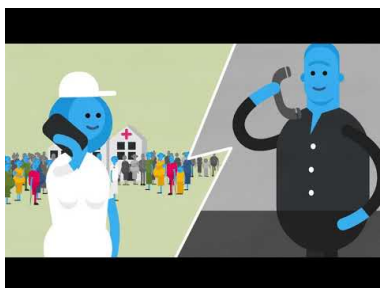
IOM and the Humanitarian- Development-Peace Nexus