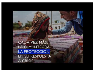
La labor de protección de la OIM en su respuesta a crisis