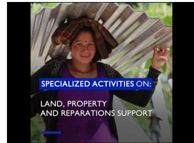
IOM's work on protection in crisis response