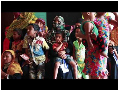
Protection is central to IOM's response to crises