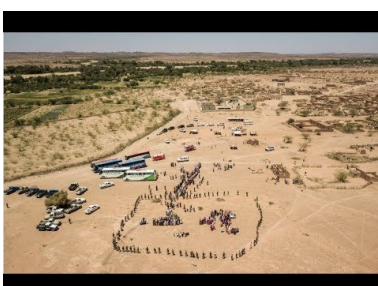
IOM Niger - Agadez Simulation Exercise - English