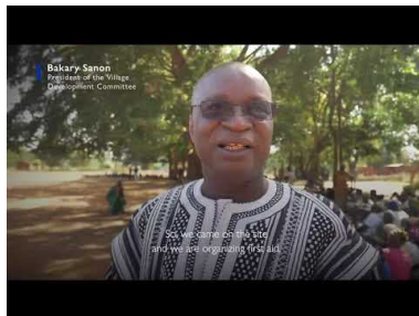
IOM Crisis Simulation Exercise in Burkina Faso