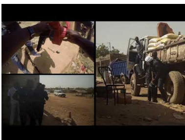
Crisis simulation exercise at the border in Kidira, December 13 2017