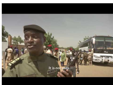
IOM Niger - Simulation exercise - Tillabéri - 2018