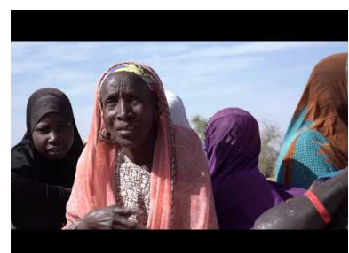
Exercice de simulation de crise transfrontalière : Kolama/Tahoua, 12 novembre 2020