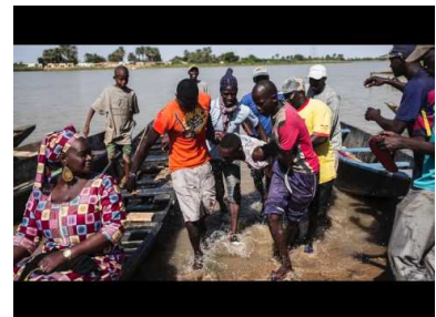
Crisis simulation exercise at the border, Dagana, 11/30/2016