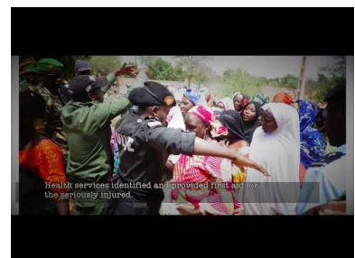
Flintlock: the simulation exercise