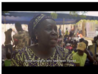
IOM Crisis Simulation in Podor, Senegal