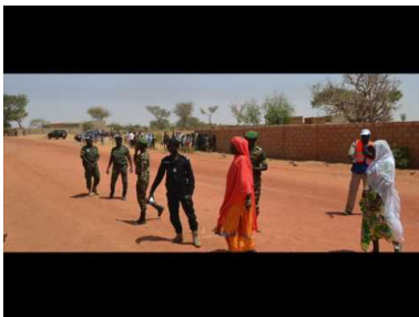
Simulation Exercise EN